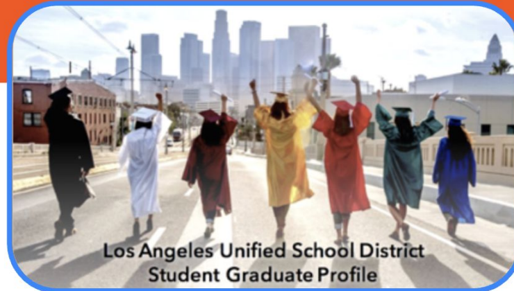
Los Angeles Unified School District Student Graduate Profile

The practice of cultivating a positive, authentic digital footprint that can be leveraged for college and career success.